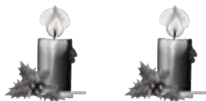
Second Sunday of Advent